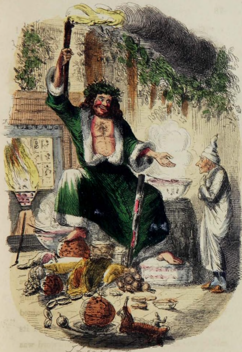
The Ghost Scrooge's third Visitor