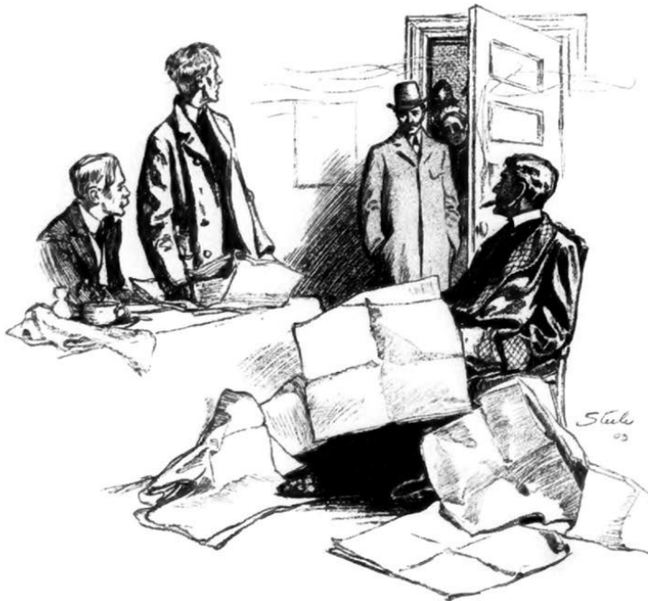
"I ARREST YOU FOR THE WILFUL MURDER OF MR. JONAS OLDACRE"

"Late last night, or early this morning, an incident occurred at Lower Norwood which points, it is feared, to a serious crime. Mr. Jonas Oldacre is a well-known resident of that suburb, where he has carried on his business as a builder for many years. Mr. Oldacre is a bachelor, fifty-two years of age, and lives in Deep Dene House at the Sydenham end of the road of that name. He has had the reputation of being a man of eccentric habits, secretive and retiring. For some years he has practically withdrawn from the business in which he is said to have amassed considerable wealth. A small timber yard still exists, however, at the back of the house, and last night about twelve o'clock an alarm was given that one of the stacks was on fire. The engines were soon upon the spot, but the dry wood burned with great fury, and it was impossible to arrest the conflagration until the stack had been entirely consumed. Up to this point the incident bore the appearance of an ordinary accident, but fresh indications seem to point to serious crime. Surprise was expressed at the absence of the master of the establishment from the scene of the fire, and an inquiry followed, which showed that he had disappeared from the house. An examination of his room revealed that the bed had not been slept in, that a safe which stood in it was open, that a number of important papers were scattered about the room, and finally that there were signs of