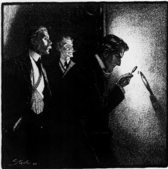
IT WAS MORE THAN A STAIN. IT WAS THE WELL-MARKED PRINT OF A THUMB

"So, my dear Watson, there's my report of a failure."