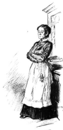
There was a sort of sulky defiance in her eyes

"Capital!" said Holmes calmly. "Watson, a bucket of water over the straw. That will do! Lestrade, allow me to present you with