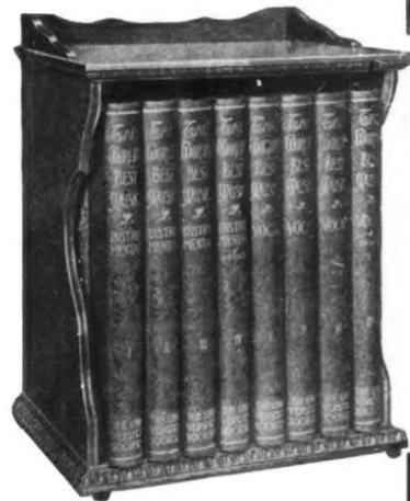
Size of volumes, 9 x 12 inches