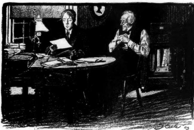
"A MASS OF DOCUMENTS, WHICH WE WENT OVER TOGETHER"

"A middle-aged woman, who was, I suppose, his housekeeper."